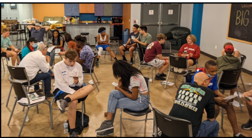
Students practicing sharing the gospel before going to the mall