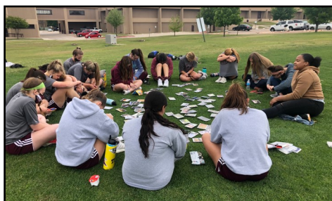
One of our weekly outreaches with the girls' soccer team.