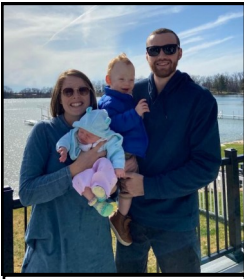
The Miller Clan