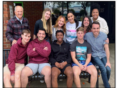
The Plano Cru staff with our graduating student leaders