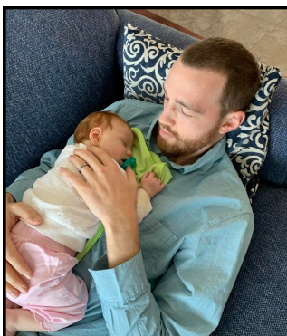
Mason &amp; Holland