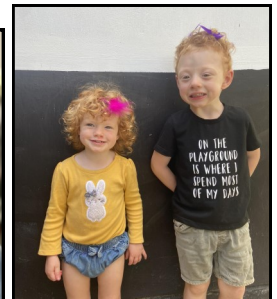
Holland and Zion