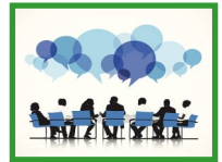
PHOTO SESSION ADDED