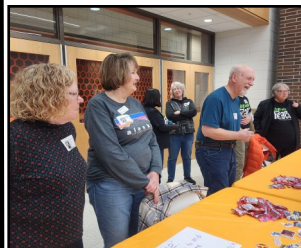
Covenant's Peace Family at Northrop

Our intergenerational Peace Families have grown in size and spirit this year. These volunteer groups - primarily composed of compassionate retirees - have expanded from South Side to all five high schools. During lunch periods and special school events, Peace Family members provide a listening ear, share encouragement, and model kindness and stability. These cross-generational relationships are building bridges, reminding students that they are seen, supported and part of a wider community that believes in them.