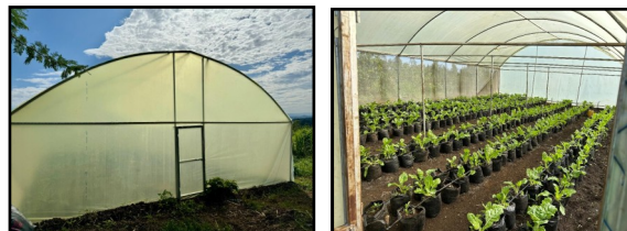
Life for Children Ministry greenhouses.

While food insecurity remains a pressing issue in the country, Life for Children Ministry is actively working to combat this challenge. They are providing valuable support to their school through initiatives like raising animals and cultivating food in greenhouses.