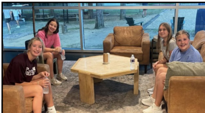
Some of our Vines freshmen at Cru