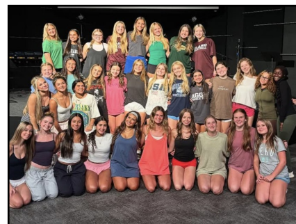
The girls at our Monday night Cru

friends with the gospel. We will meet next week to come up with a plan for a drill team outreach at Vines. It is also cool that she wants to start an outreach with the drill team as we have had a difficult time reaching this specific team at Vines due to barriers with coaches. We are praying for open doors with the drill students and are trusting God to help Caroline lead an outreach with the team.