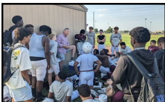
Sharing the gospel with the freshman football team!