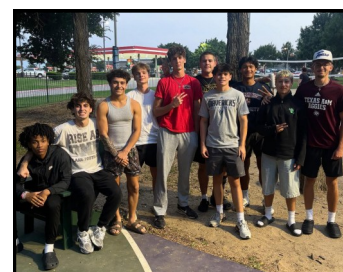
Some of the guys at Monday night Cru

Thank you for partnering with us to take the gospel to high school campuses. The Spirit is moving and drawing students to himself. We wouldn't be able to do this without you!