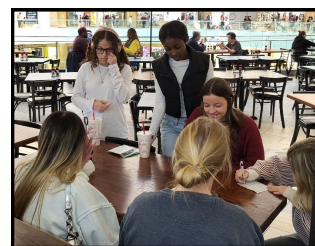
Students initiating spiritual conversation at the mall

PAST - Praise God for drawing students to himself at FastBreak - including 3 from Plano who started a relationship with him for the first time!